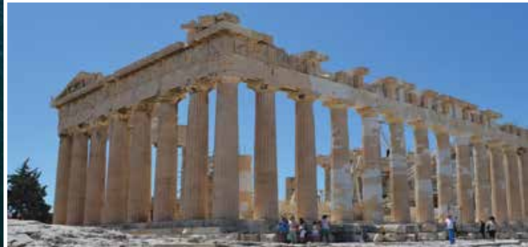
Clockwise: Zodiac landings allow access to smaller ports; Gallipoli Soldiers Memorial; Acropolis in Athens.