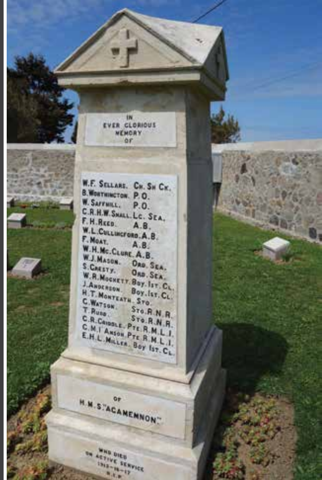
HMS Agamemnon Memorial East Mudros Lemnos.

words (2017). He is editor of the Cambridge History of the First World War , which has appeared in English, French and Chinese. He won an Emmy award in 1997 as producer and historian of the BBC/PBS series The Great War and the shaping of the twentieth century , and is a founder and emeritus director of the Historial de la grande guerre, a museum of the First World War on the Somme.