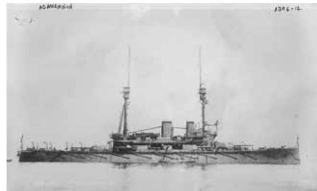
HMS Agamemnon c 1915 - Armistice with Ottoman Empire signed on board 30 October 1918, Mudros Harbour. (Torpedo nets attached to 'oars').