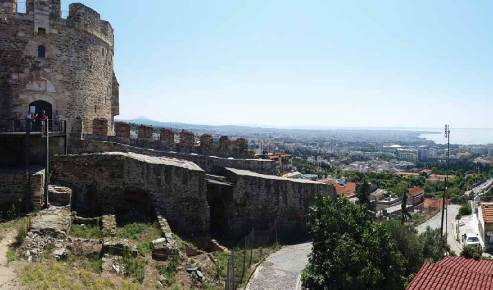
Eptapyrgio Castle - Thessaloniki.