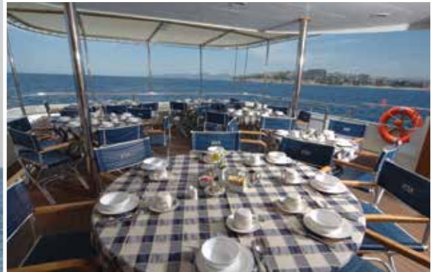
Clockwise: Panorama II - a classic modern sail cruiser; Cat 2 Twin Cabin; Outdoor dining on the upper deck.