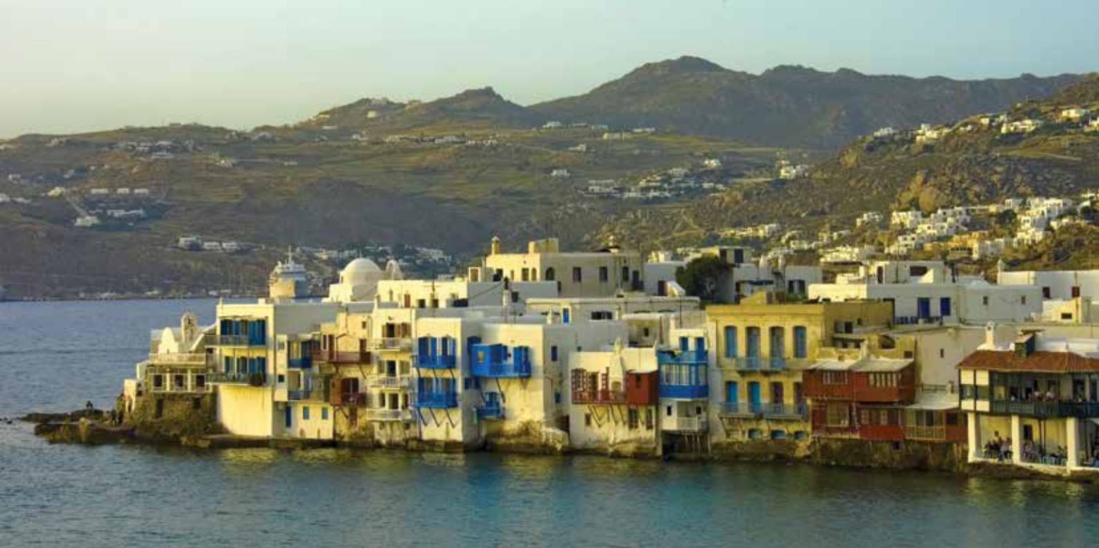
Explore the alleyways of Mykonos.

their ailments. We delve into this ancient world, learning more from local experts and enjoying the remaining grand architecture of the Roman Empire.